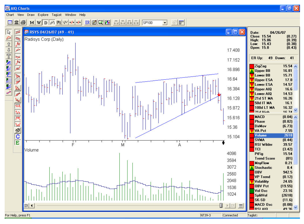
Figure 3 . Daily chart of Radisys Corp with a Rising Wedge pattern (bearish pattern) that was automatically found and drawn on the chart by AlQ's Chart Pattern Recognition function. Red down arrow indicates completion of the pattern and sell point for the stock.

<u>Figure 3</u> shows Radisys Corp (RSYS) with its Rising Wedge